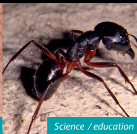
Science / education