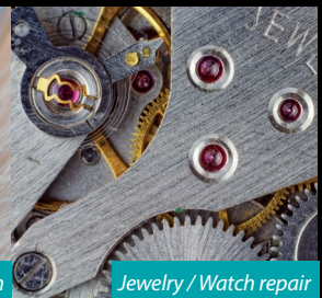
Jewelry / Watch repair